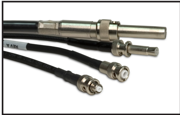
High voltage cables

Operation is simple. The parameter being adjusted or set is displayed separately and can be entered without affecting the actual output voltage. Up to nine instrument configurations can be stored and recalled at any time, making it easy to run multiple tests.